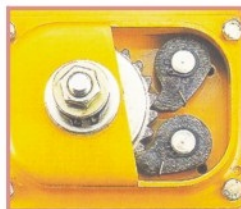
Double brake pawl for extra safety on BHW-1800 and BHW-2600 models.