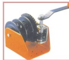
HW-1500 Worm drive non-brake