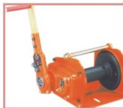
SF-2200 Ideal for use in confined locations, the ratchet handle permits reciprocating handle movement in both directions for hoisting and lowering loads.